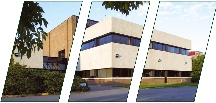
Head Office – The Reading Science Centre